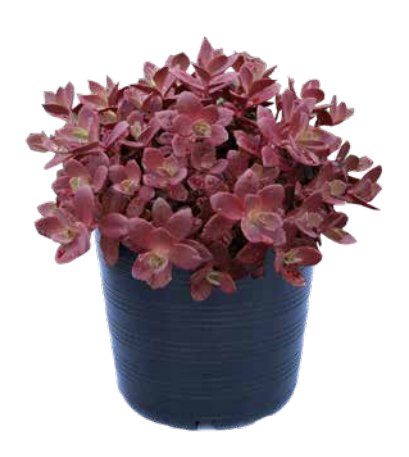
Firecracker Sedum 'Firecracker' (b