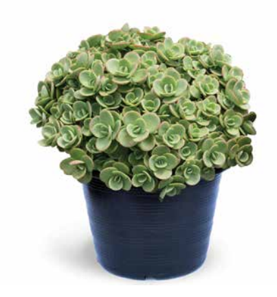
Lime Zinger Sedum 'Lime Zinger' (Þ