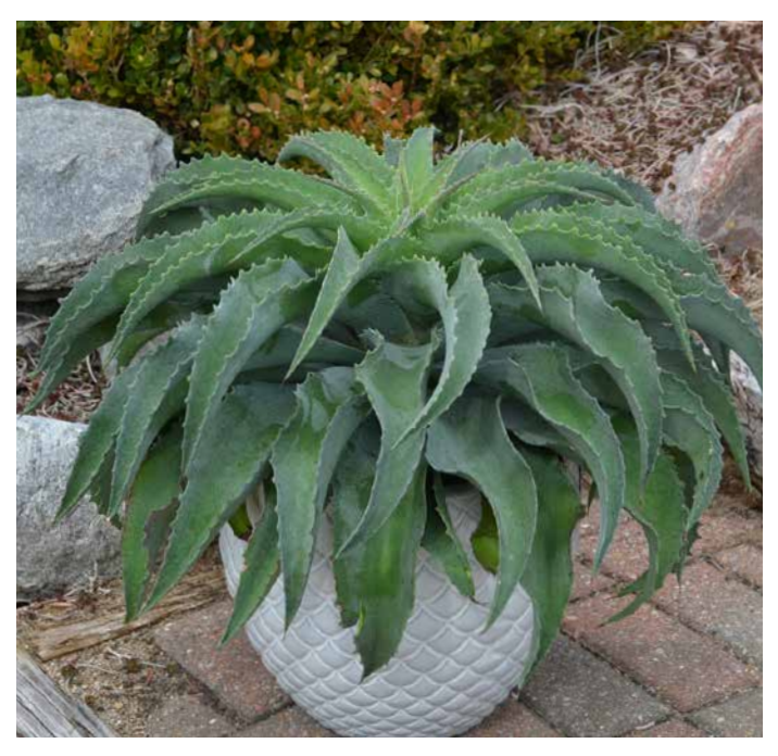
Falling Waters x Mangave 'Falling Waters'