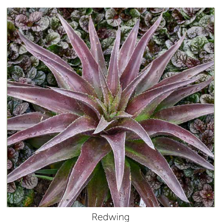
x Mangave 'Redwing'