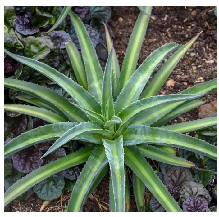
Shadow Waltz x Mangave 'Shadow Waltz'