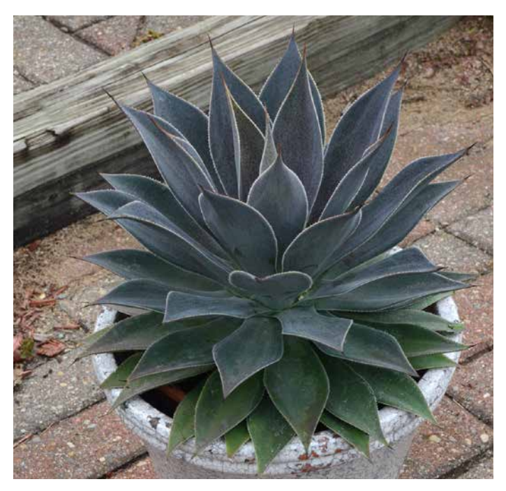
Lavender Lady x Mangave 'Lavender Lady' (b