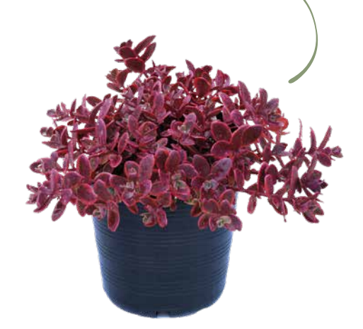
Wildfire Sedum 'Wildfire' (b