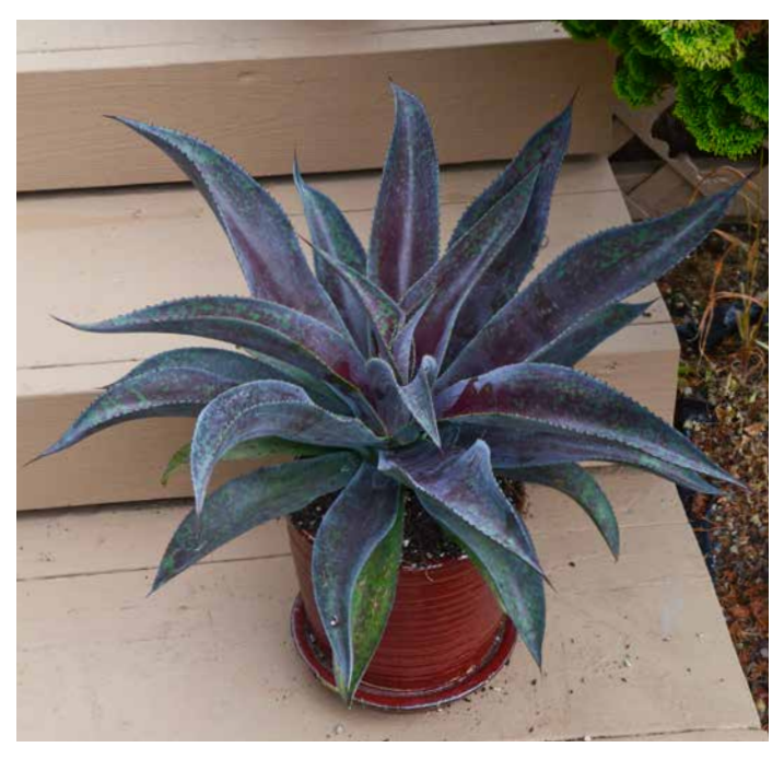
Mission to Mars x Mangave 'Mission to Mars' (D