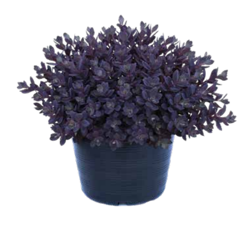
Plum Dazzled Sedum 'Pldazz2018' (b