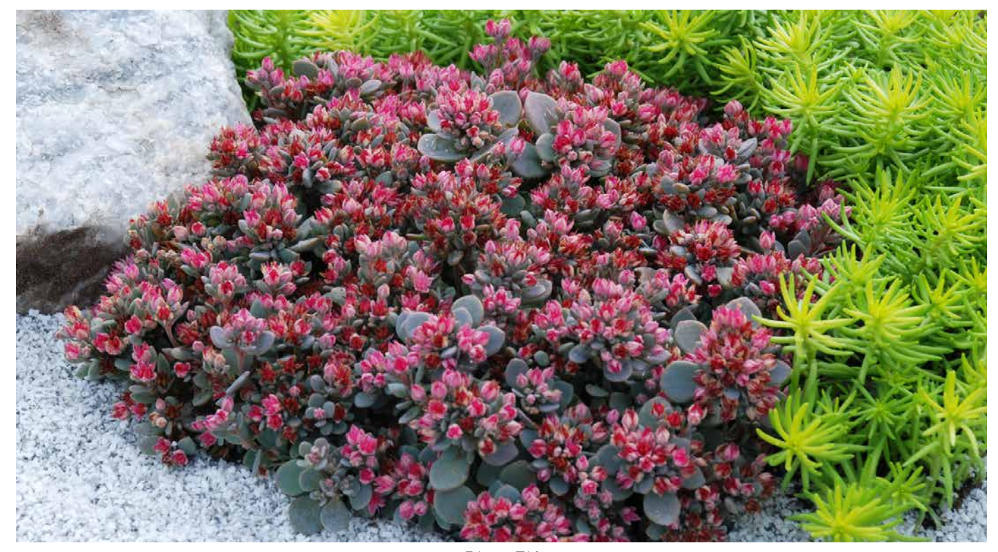
Blue Elf Hylotelephium x Orostachys malacophylla 'Blue Elf'.