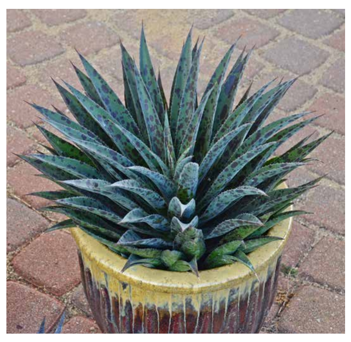
Pineapple Express x Mangave 'Pineapple Express' (D