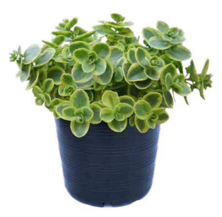
Lime Drop Sedum 'GS201801' PBRe