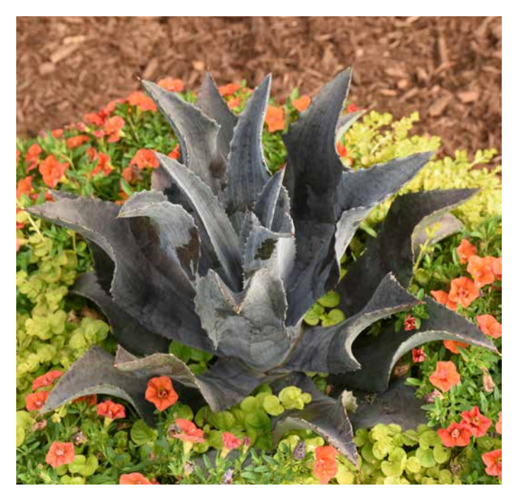
Night Owl x Mangave 'Night Owl'