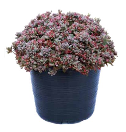
Blue Elf Hylotelephium x Orostachys malacophylla 'Blue Elf'. (<sup>()</sup>