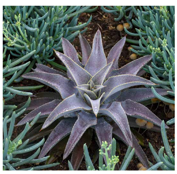
Purple People Eater x Mangave 'Purple People Eater'