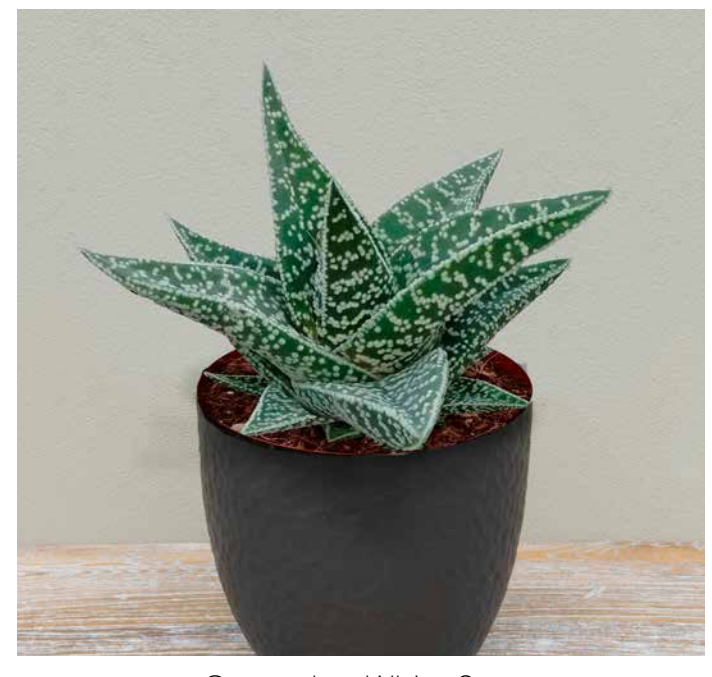
Gasteraloe White Spot