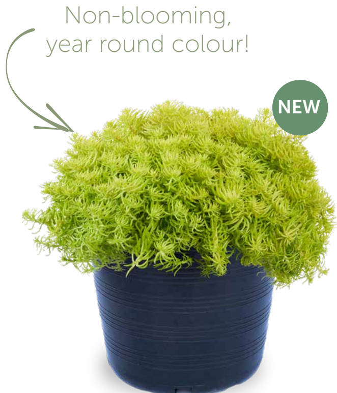
Angelina's Teacup Sedum 'ATC2018' PBRe