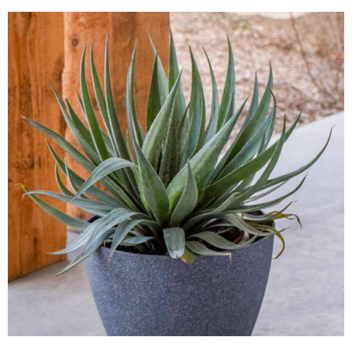
Jumping Jacks x Hansara 'Jumping Jacks'