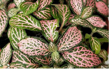
Pink Forest Flame