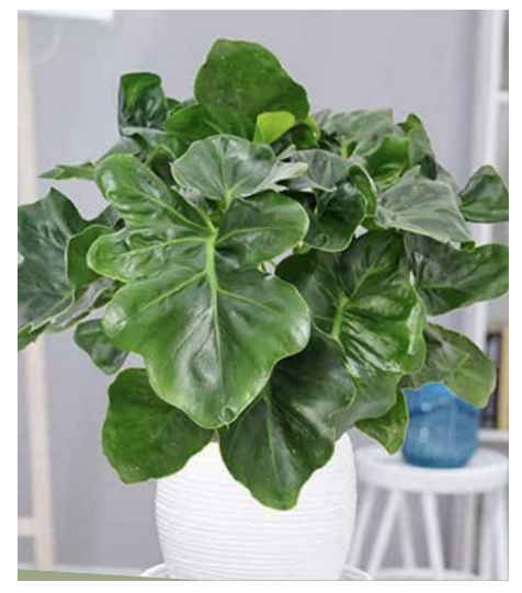
Philodendron Super Atom