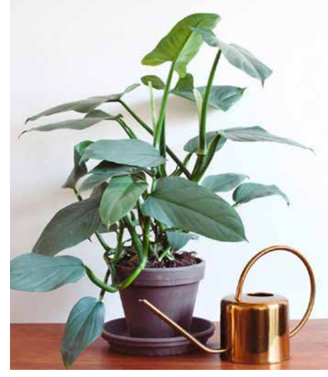
Philodendron gray 'Silver Sword'