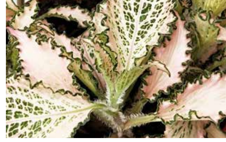
Light Pink Anne